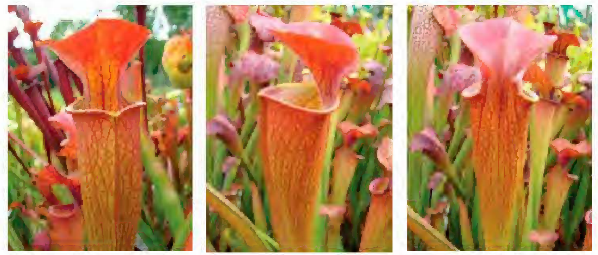
Figure 5: Sarracenia 'Orange Fire' pitchers.

Vegetative propagation is necessary to maintain the unique features of this hybrid.